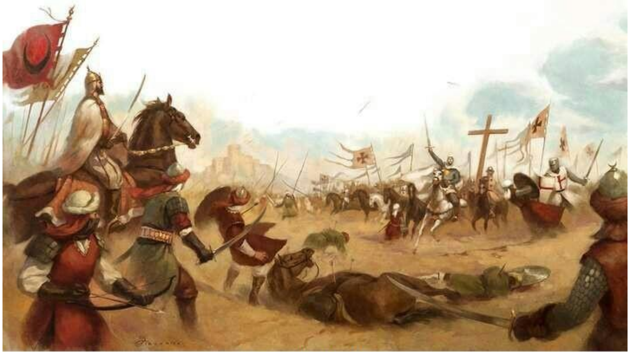
Saladin meets with Richard the Lionheart

No one admired this King's renown for bravery more than Saladin himself, who was a generous and gallant enemy. When Richard lay ill of a fever, Saladin sent him fresh fruits from Damascus, and snow from the mountain-tops. Courtly messages and compliments were frequently exchanged between them—and then King Richard would mount his horse and kill as many Saracens as he could; and Saladin would mount his, and kill as many Christians as he could. In this way King Richard fought to his heart's content at Arsoof and at Jaffa; and finding himself with nothing exciting to do at Ascalon, except to rebuild, for his own defence, some fortifications there which the Saracens had destroyed, he kicked his ally the Duke of Austria, for being too proud to work at them.