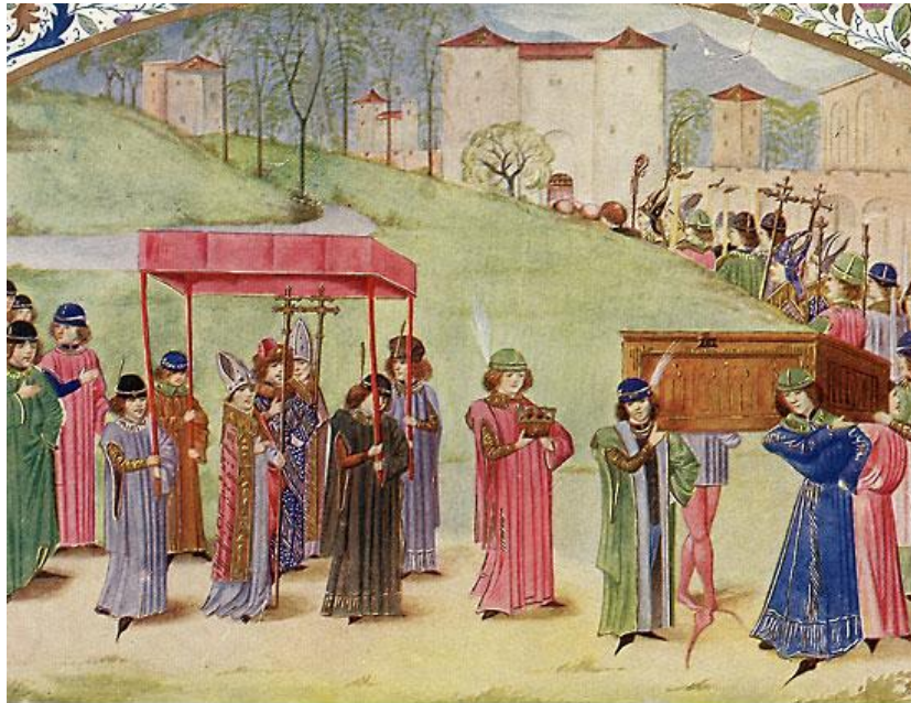
A procession for Richard the Lionheart's coronation.

The Lion Heart – John Lackland - The Great Charter – Runnymede – Vox Populi, Vox Dei – Hubert de Burgh and the Black Band – The Black Death in England