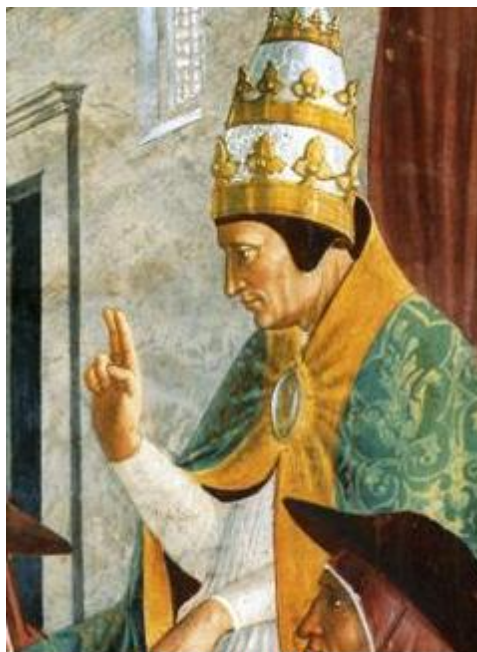
Pope Innocent III

The Pope said that neither of these men should be archbishop, and he chose another man altogether, called Stephen Langdon... In fact no better archbishop could have been chosen. But John was furiously angry when he heard that his friend was not to be allowed to be archbishop, and he banished Stephen Langdon from the country.