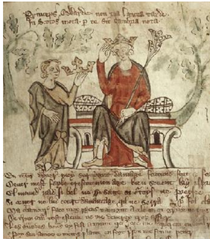
Edward II's Coronation

running up debts. On Edward I's last unsuccessful campaign against the Scots in Carlisle in the winter of 1306–7, the prince had suggested giving Gaveston some of the royal estates in France. His father exploded, seizing Edward by the hair and tearing it out in tufts. He ordered Gaveston into exile.